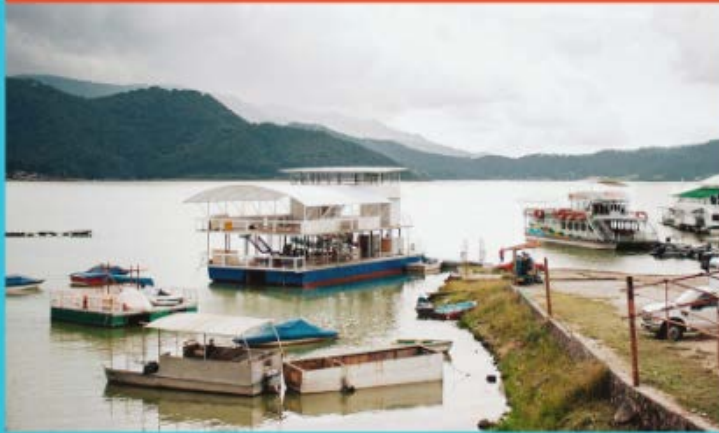
Serene Lake Avandaro in Valle de Bravo, Mexico.