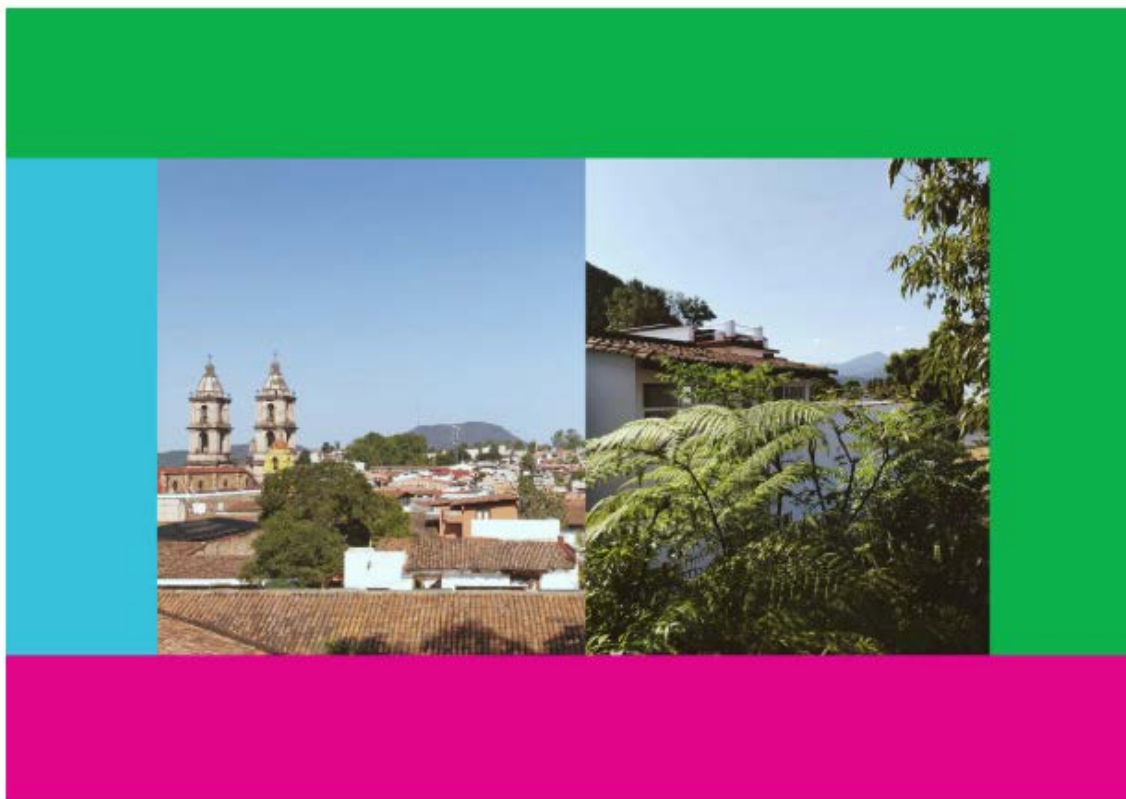
Views of Valle de Bravo and the surrounding hills.

Where do you go when you're looking to travel beyond all that CDMX has to offer ? Below, the perfect side trip to Valle de Bravo.