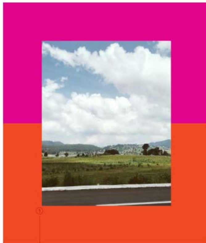
On the road, between Mexico City and Valle de Bravo.

Enter Valle de Bravo. Valle is one of Mexico's magic towns—in 2005 it was, quite literally, christened a "Pueblos Mágico" by the Mexican government. This is because, unlike much of urban Mexico, which has undergone waves of invasive modernization over the years, Valle de Bravo is a preserved colonial town. It was founded in 1530, and much of the original architecture still stands. Valle is a place out of time, with more than a little magic to it—and while it is a beloved destination within Mexico, the rest of the world essentially has no idea it's there.