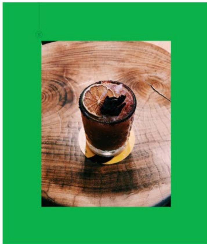
A delicious mezcal and citrus concoction at Rūf in Valle de Bravo.