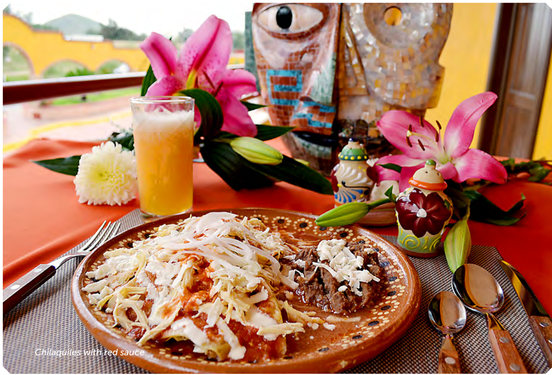
Chilaquiles with red sauce