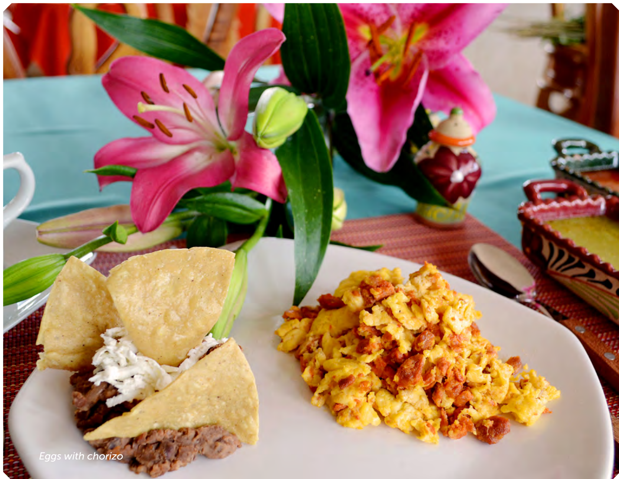
Eggs with chorizo