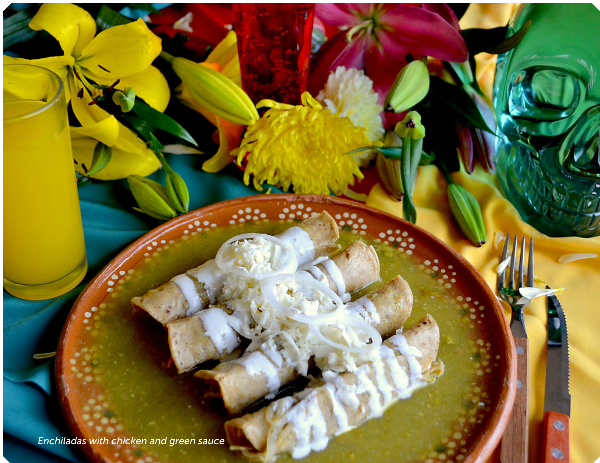
Enchiladas with chicken and green sauce