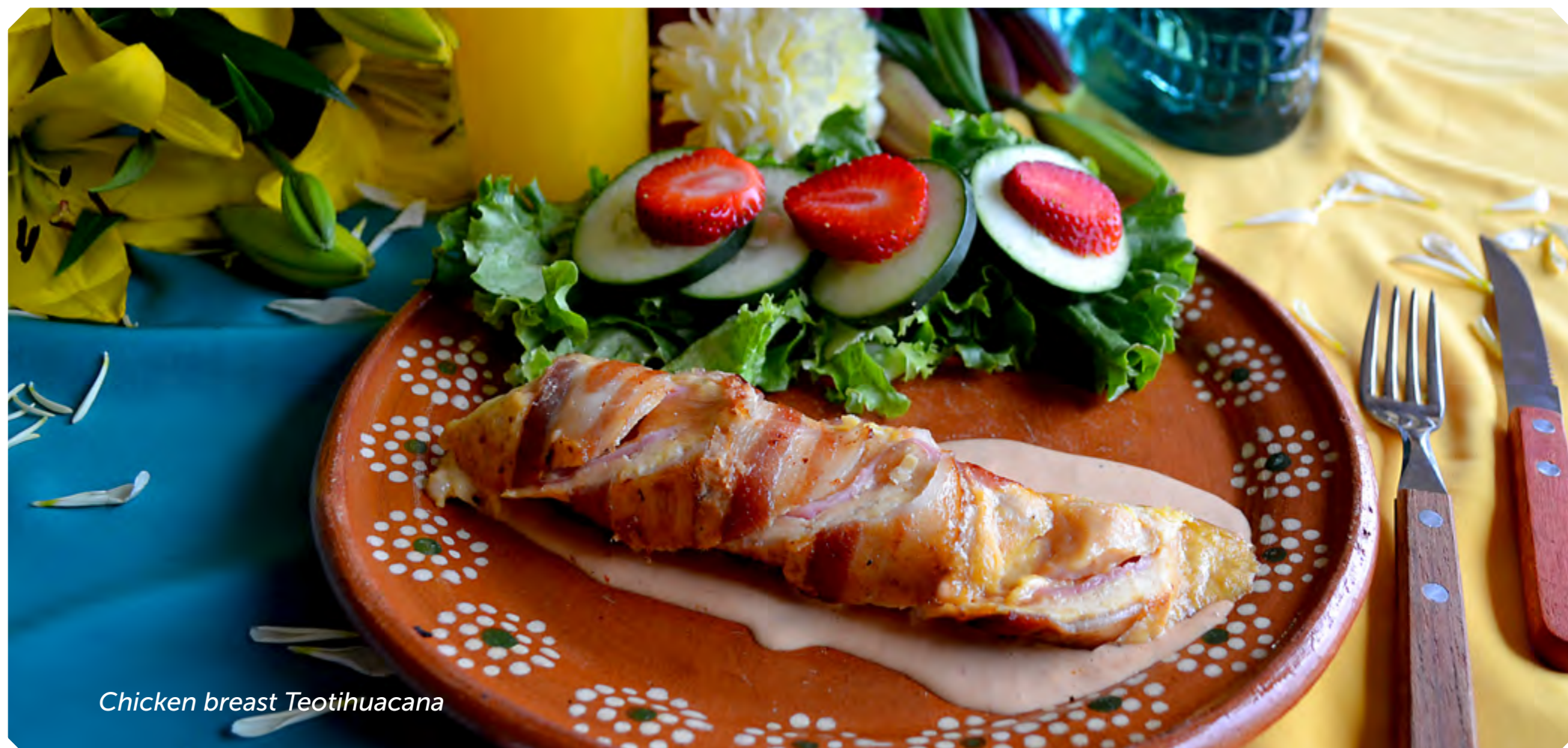
Chicken breast Teotihuacana