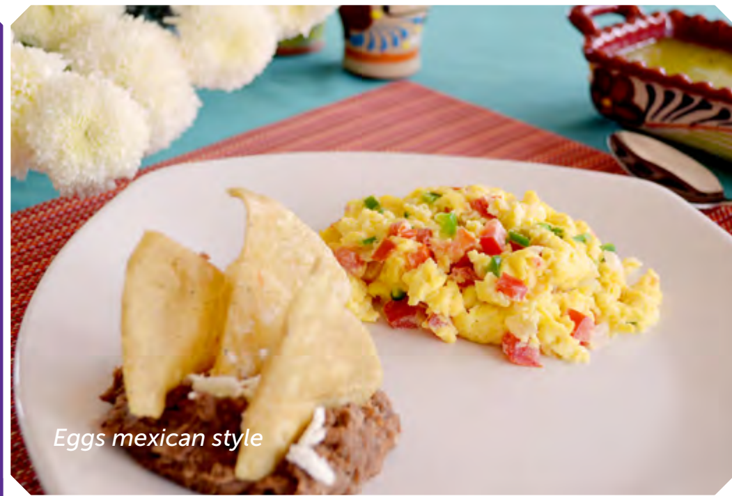
Eggs mexican style