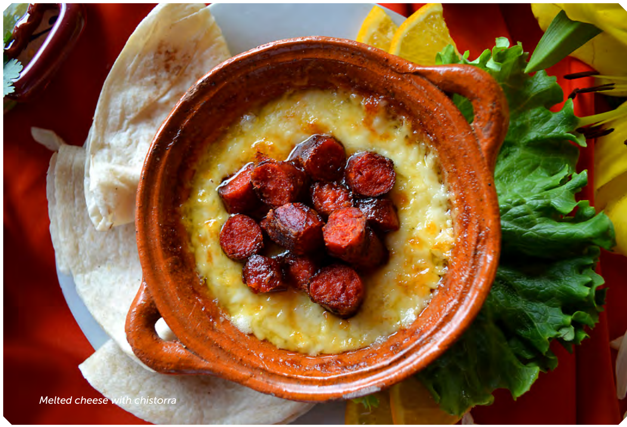
Melted cheese with chistorra