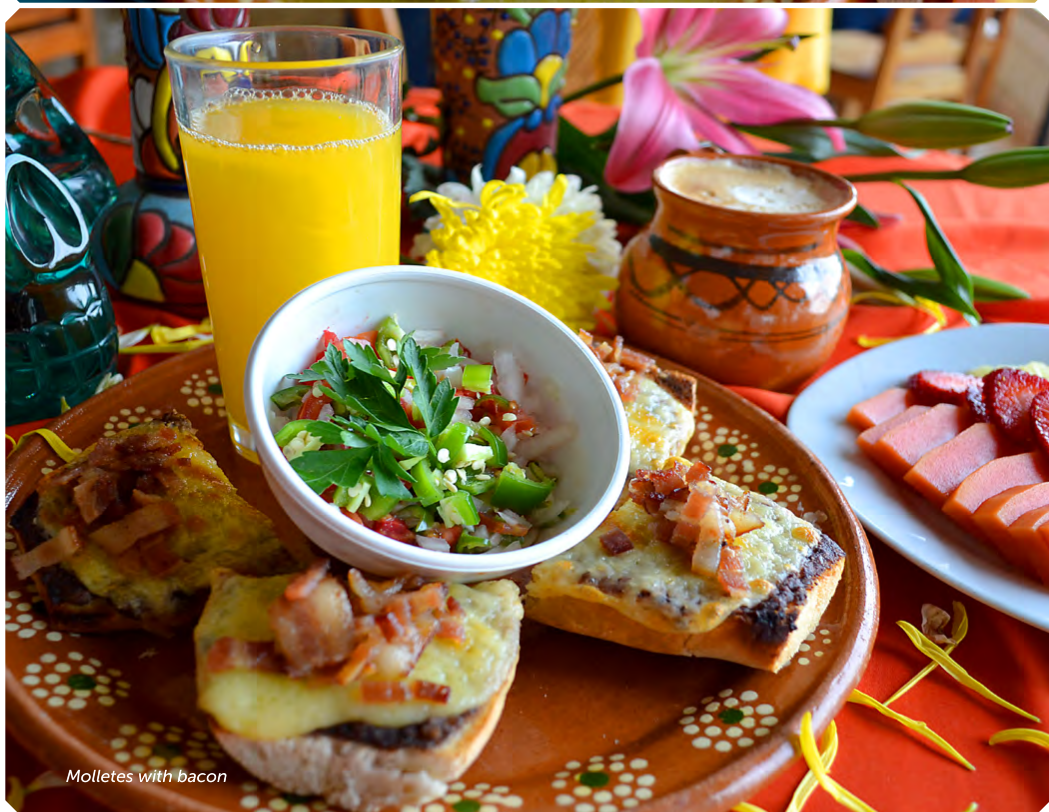
Molletes with bacon