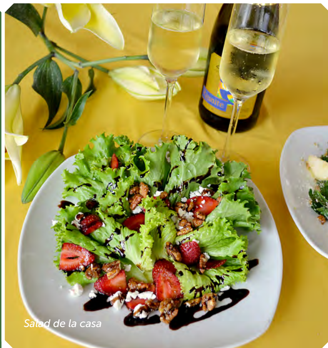
Salad de la casa

Delicious pork ribs bathed in peanut sauce accompanied with rice and refried beans.